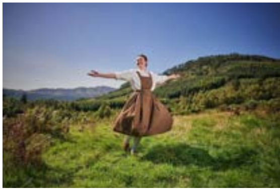
Artwork for The Sound of Music, © Fraser Band

The beautiful Pitlochry Festival Theatre will be bringing those hills to life with the sound of music next winter, with a new staging of the Rodgers and Hammerstein classic. In fact, the show is only one of three revivals the Scottish venue is offering, with Beautiful – The Carole King Musical and Footloose featuring in their bountiful summer season. Pitlochry Festival Theatre, from 15 November.