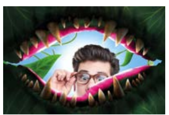
The artwork for Little Shop of Horrors