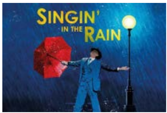
Artwork for Singin' in the Rain

The lovely outdoor theatre at Kilworth House in Leicestershire has been providing some stellar musical revivals in the past, and in 2024 they'll be bringing the musical adaptation of the classic film Singin' in the Rain to the stage. Expect some major choreography and don't worry about the actual rain because they've got a massive tarpaulin to keep punters dry! Kilworth House Theatre, from 18 June.