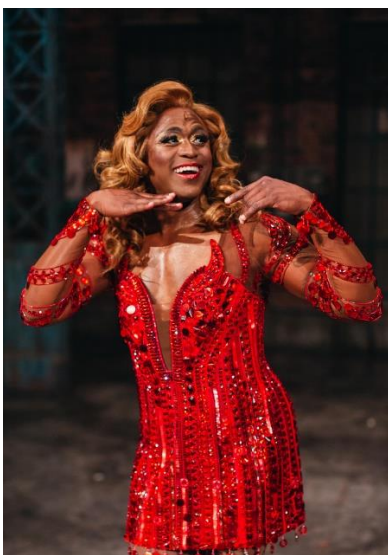
Wayne Brady

Wayne Brady to lead Hollywood Bowl's Kinky Boots .