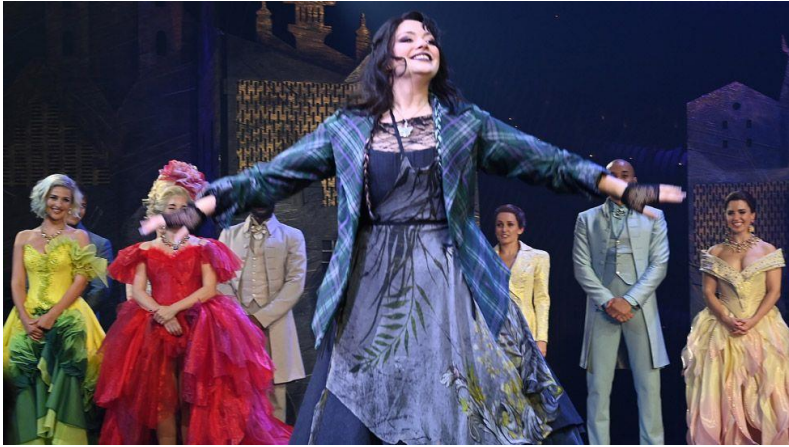
Carrie Hope Fletcher plays the title role in Cinderella - described by critics as having a "snappy contemporary edge"