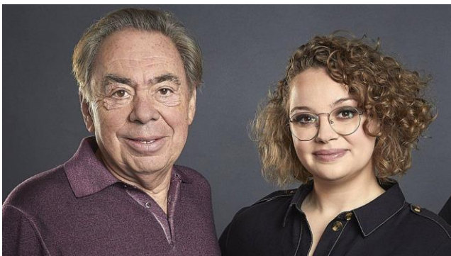
Andrew Lloyd Webber's production, starring Carrie Hope Fletcher as Cinderella , opened last August