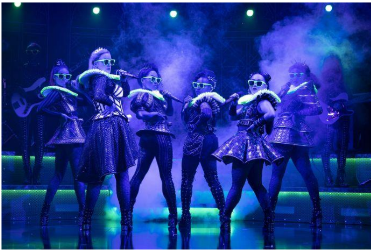
The original Broadway cast of 'Six'

Six is set to release an original Broadway cast recording. The album, entitled Six: Live on Broadway was recorded live onstage on 3 October 2021, during opening night of the production. According to press representatives, Six: Live on Broadway marks the first time an original Broadway cast recording has ever been recorded live on opening night. "After two and a half long years it is a dream come true to release Six 's Broadway cast recording, which was captured live on a night that ignited the Broadway community at the Brooks Atkinson Theatre," the producers of Six said. "The applause and cheers of the 1,069+ people in the audience that night can all be heard on this historical collection. As we listen, sing and dance along to the gorgeous voices of the original Broadway cast, we are transported back to that magical night when we finally got to say 'Happy Opening!'" The recording will be released via streaming and digital formats. Physical CDs and vinyls will be announced at a later date. Six: Live on Broadway will include 18 tracks featuring the original Broadway cast, plus a bonus track by the Broadway Alternates. The all-female band 'The Ladies in Waiting' are also featured on the recording. Toby Marlow and Lucy Moss said, "We wanted to capture that buzz, that electric atmosphere that can only be created by a group of pop royalty stepping out onstage in front of an audience of squealing fans. So – welcome to the show."