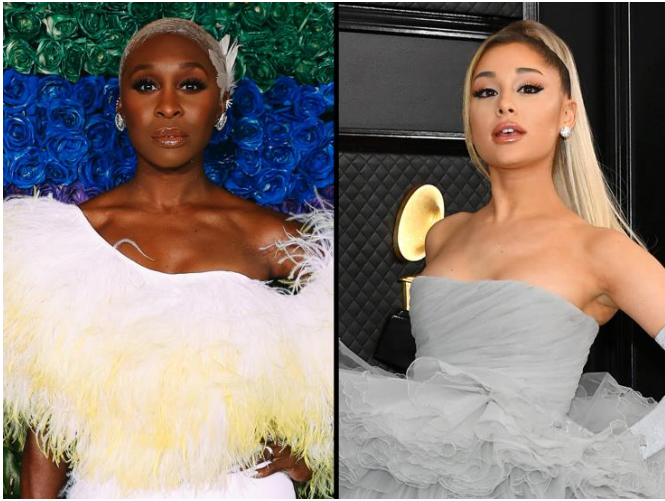
Cynthia Erivo & Ariana Grande