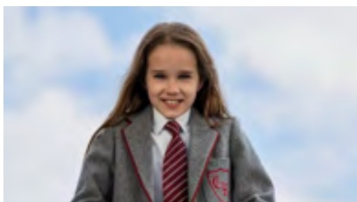
Alisha Weir in Matilda the Musical

An adaptation of the musical written by Denis Kelly and with a musical score by Tim Minchin is heading to Netflix. Directed by Matthew Warchus, who directed the stage musical, and originally based on the Roald Dahl novel, Matilda the Musical tells the beloved story of Matilda Wormwood, an extraordinary girl, with a vivid imagination, who dares to take a stand to change her story with miraculous results. Starring Emma Thompson as the villainous Miss Trunchbull, the musical movie will premiere on Netflix.