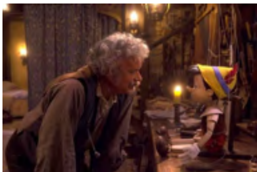
Tom Hanks in Pinocchio

There's a new screen adaptation of Pinocchio on the way! Starring Tony Award nominee and entertainment legend Tom Hanks as Gepetto and Tony Award winner Cynthia Erivo as the Blue Fairy, the live-action adaptation of Pinocchio will premiere on Disney+ on 8 September 2022, featuring beloved songs like "When You Wish Upon A Star" and "I've Got No Strings" as well as new songs by Glen Ballard.