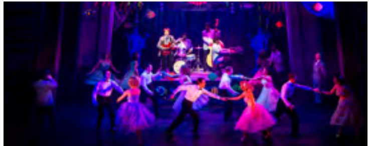
The London company of "BACK TO THE FUTURE"