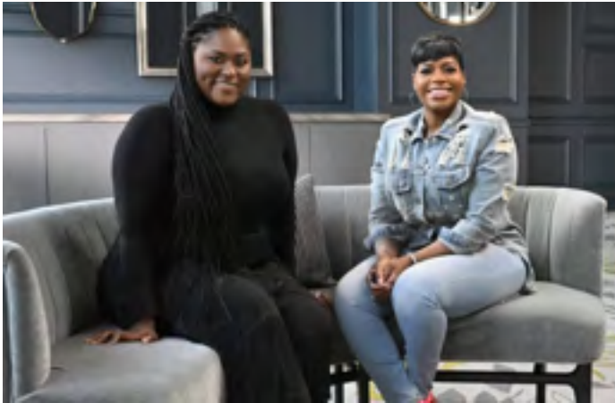
Danielle Brooks and Fantasia Barrino, Stars of The Color Purple .

Based on the musical adaptation that premiered on Broadway in 2005 and was revived to great acclaim in 2015, The Color Purple will come to the big screen in December 2023. Starring Fantasia Barrino as Celie and Danielle Brooks as Sofia, reprising the role they played on Broadway, The Color Purple cast includes names like Colman Domingo, Corey Hawkins, Taraji P. Henson, and H.E.R. Make a “joyful noise” when the movie musical is released 20 December 2023.