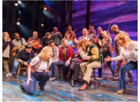
The West End cast of "COME FROM AWAY"